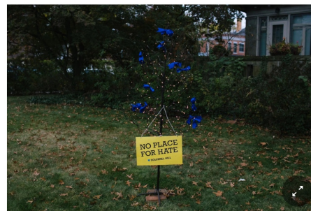
A tree in the Squirrel Hill neighborhood of Pittsburgh, where 11 worshippers were killed at a synagogue in October 2018.

'We don't know the full scope of anti-Muslim hate crimes and other hate crimes,' he said."