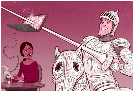
Illustration by Koren Shadmi